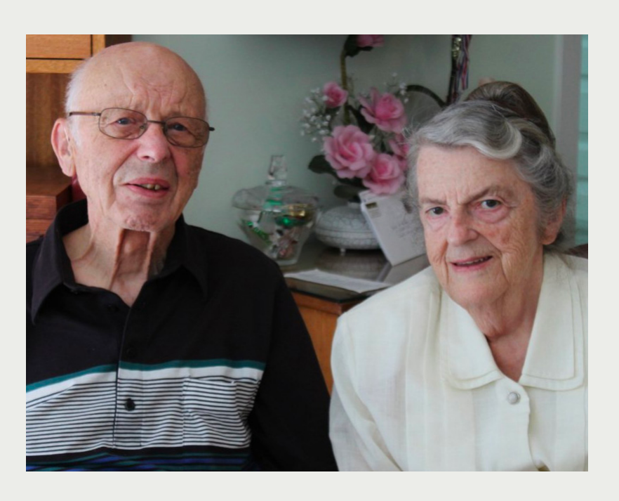
The family would like to sincerely thank everyone for their care and thoughtfulness at this time.

Of stepping on shore & finding it Heaven Of taking hold of a hand & finding it God's hand Of breathing a new air & finding it celestial air Of feeling invigorated & finding it immortality Of passing from storm & tempest To an unbroken calm Of waking up & finding it HOME!