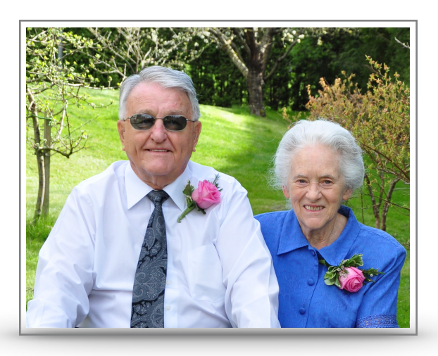
Psalm 1: Blessed is the one . . . whose delight is in the law of the Lord: and in his law doth he meditate day and night. And he shall be like a tree planted by the rivers of water, that bring forth his fruit in his season